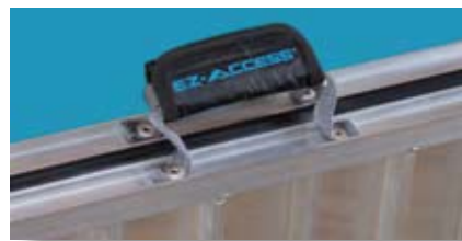
Ergonomically designed flexible, non-breakable handles offer convenient carrying and a comfortable grip