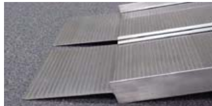
Bottom transition plates self-adjust to accommodate uneven terrain