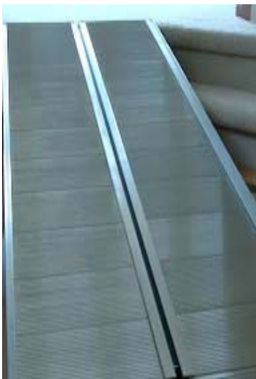
Features a no-pinch, non-protruding live hinge for safe, silent, and maintenance free operation

We are proud to introduce the SUITCASE® Signature Series® portable wheelchair ramp. Its single-fold design sets up quickly and folds in half lengthwise to be carried like a suitcase when not in use and features several innovative design enhancements. From the no pinch, non-protruding full-length live hinge and durable, ergonomically designed handles to the enhanced extruded tread for superior traction, this ramp was redesigned from the ground up to be simply the best in the industry. Top Lip Extension (TLE) compatible. Available in 2' – 8' lengths with an 800-pound weight capacity.